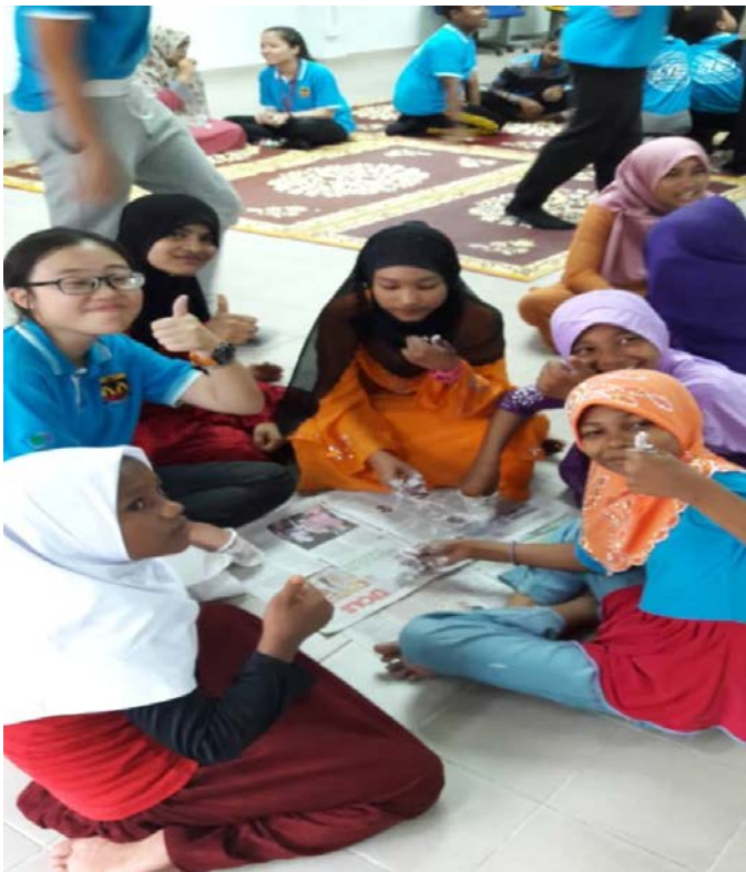
14 March 2019 -Student Leaders from Dato Jaafar Secondary School at the Rohingya School