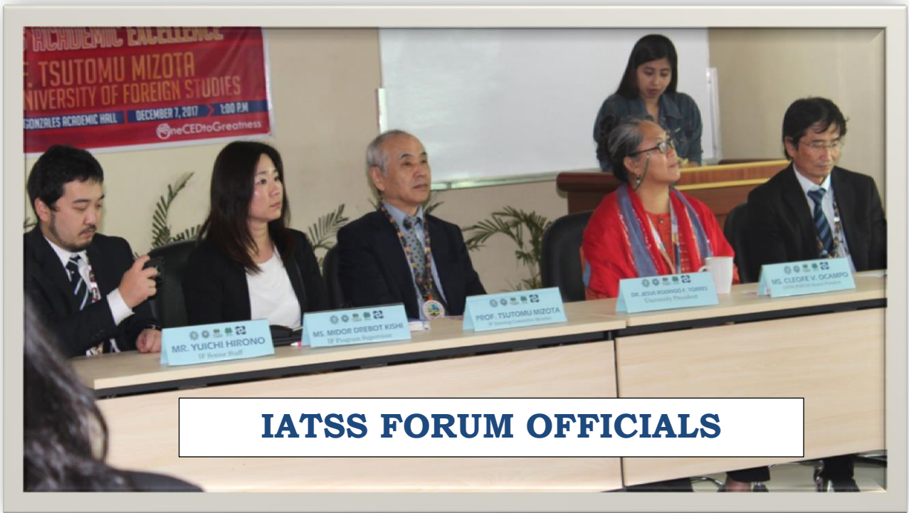
IATSS FORUM OFFICIALS