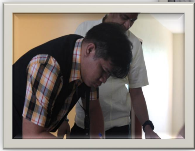
The Participants during the PR Activity and Seminar on