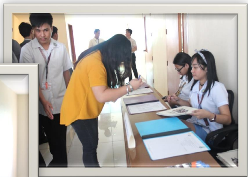
Collaborations Participants during the registration