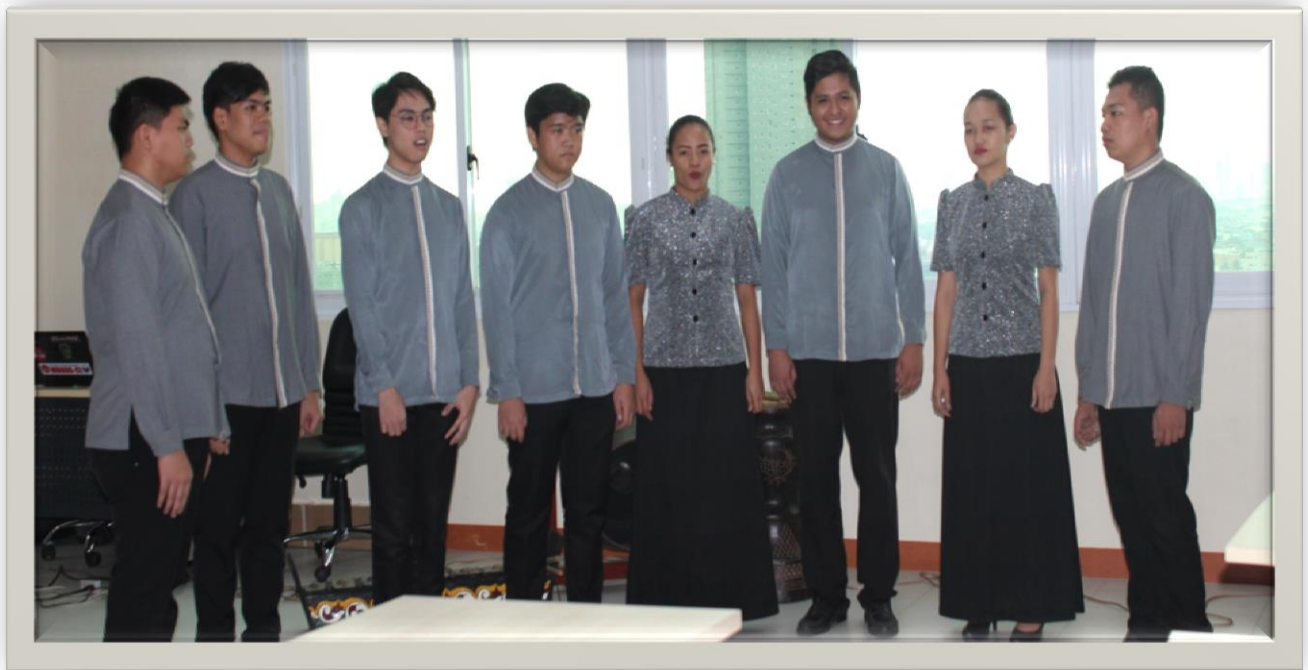
DOXOLOGY led by the RTU-Himig Rizalia