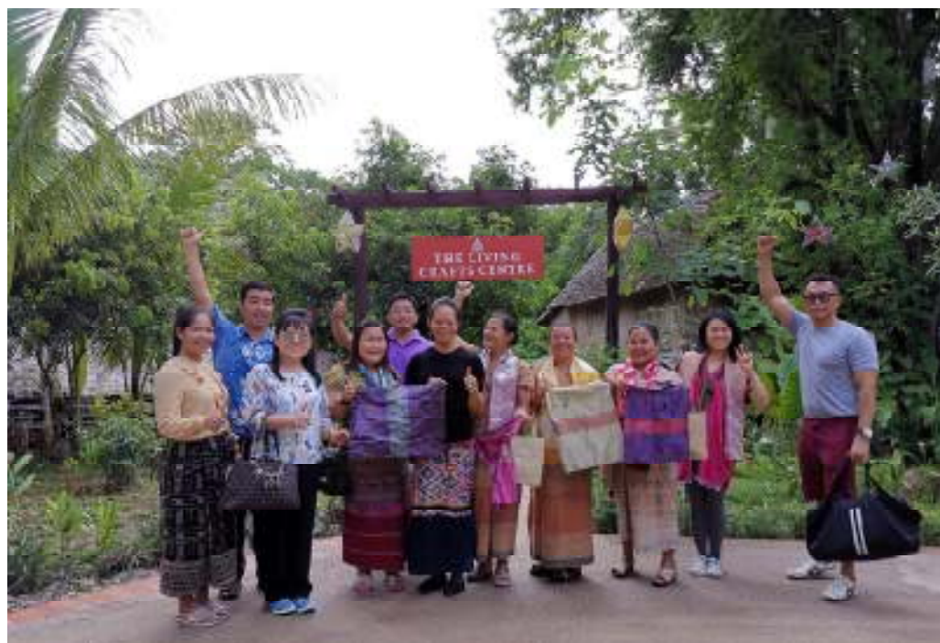
Caption: Members of women’s weaving group of Huai Hin Dam village visited OckPopTok

The priority issues elaborated above pertain to IATSS Forum’s thematic interest in contributing to sustainable community development. In addition, this TIFA-LIFA collaborative project would provide a platform for both alumni associations to work together in the role of social facilitator and connector, fostering cross-country exchange and understanding.