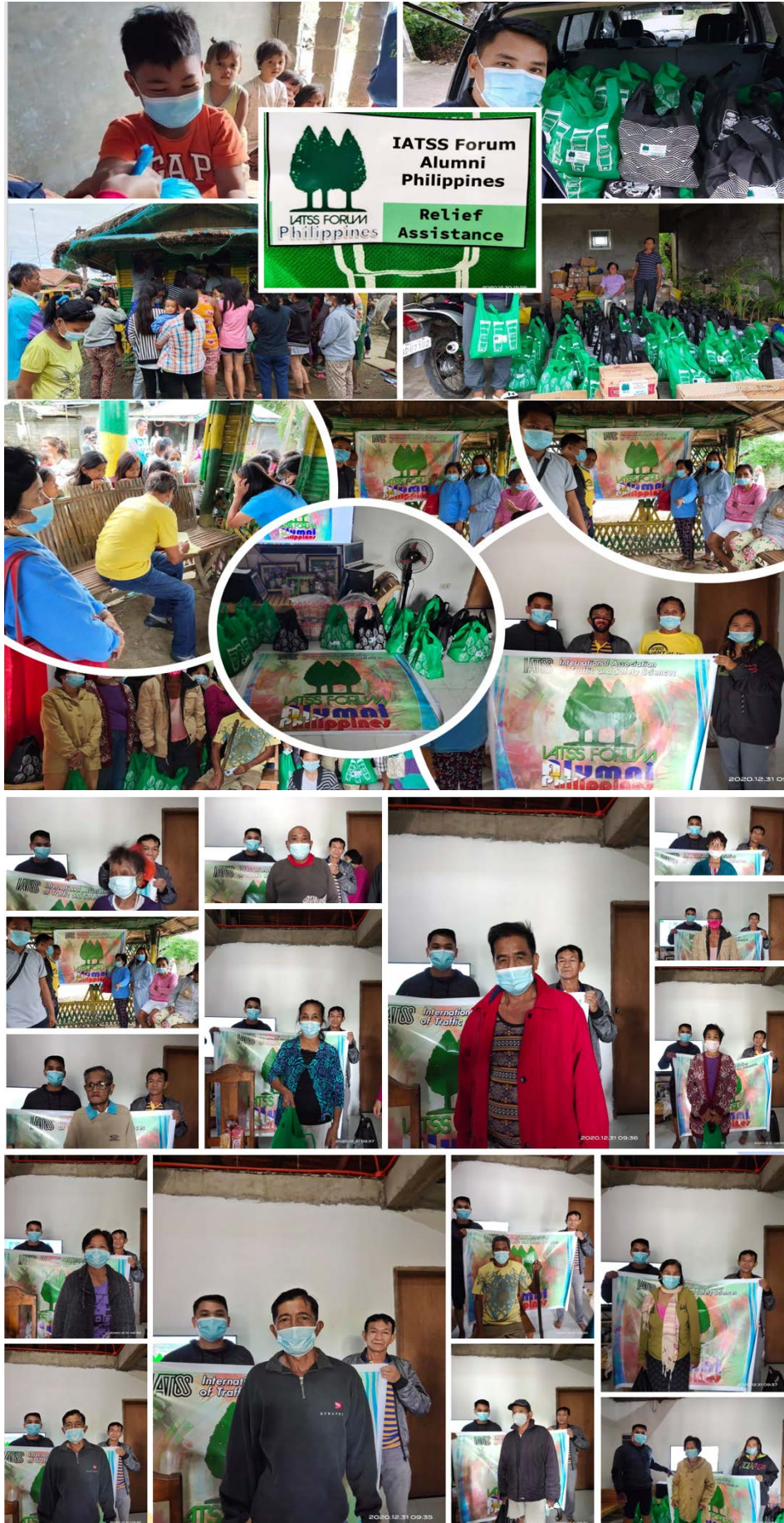
Continuation... Area: Cabagan & Tumauni, Isabela

Date of Implementation: 31 December 2020