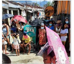
Continuation... Area: Montalban, Rizal