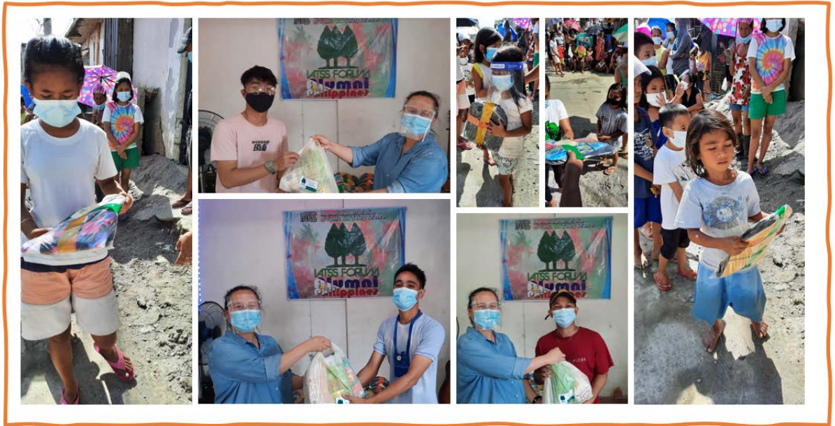
Continuation... Area: Montalban, Rizal